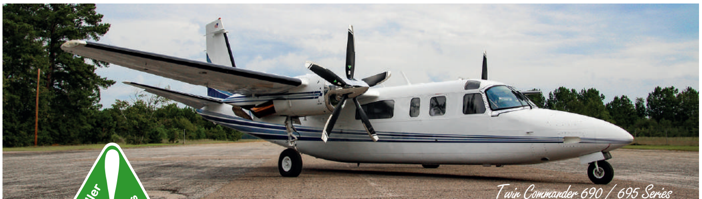
Twin Commander 690 / 695 Series