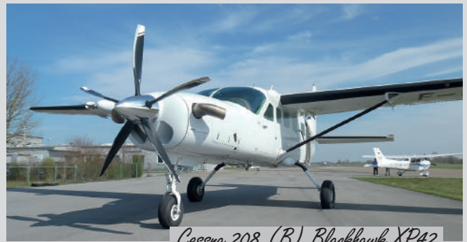
Cessna 208 (B) Blackhawk XP42