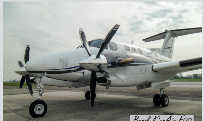
Beech KingAir F90