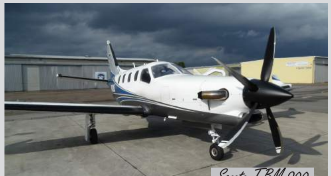
Socata TBM 900